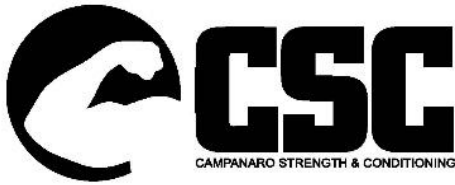
Campanaro Strength & Conditioning