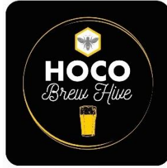
HoCo Brew Hive