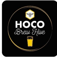
HoCo Brew Hive