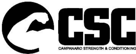
Campanaro Strength & Conditioning