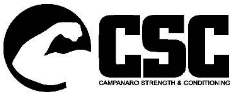
Campanaro Strength & Conditioning