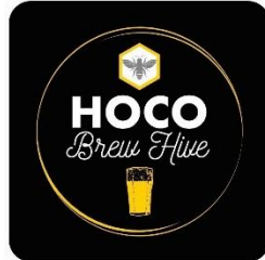
HoCo Brew Hive