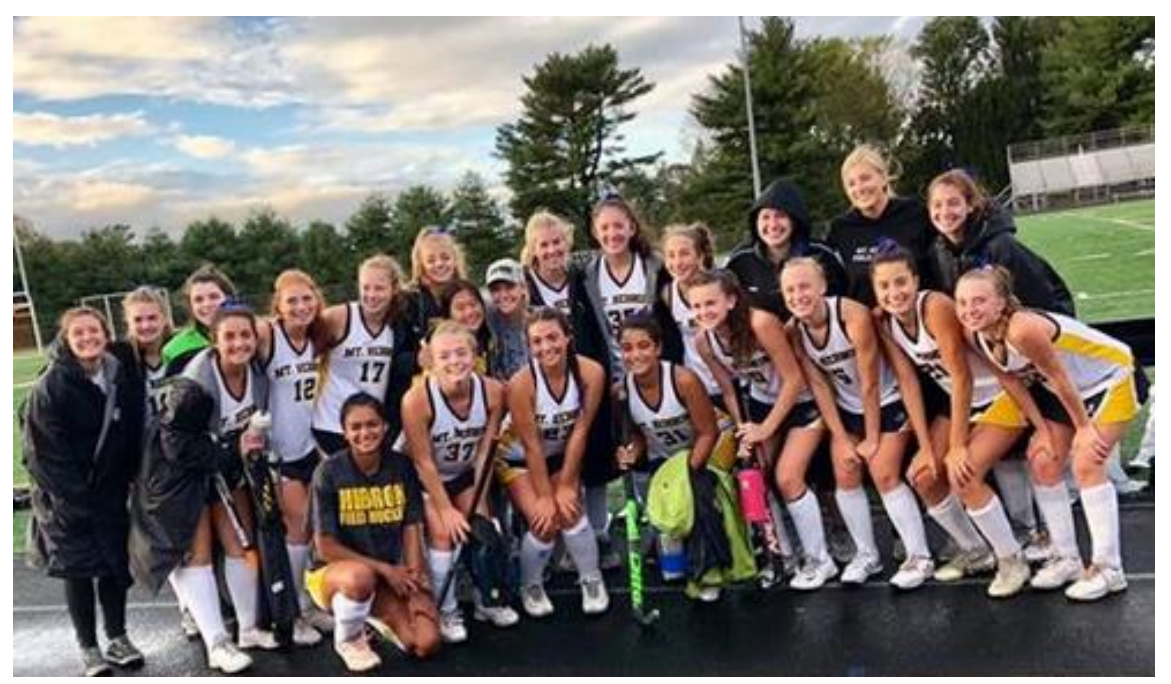
Congratulations to our Howard County Champions Field Hockey Team! So proud of these incredible student athletes & their coaches!!

**For even more celebrations & good news, follow us on Twitter: @hcpss_mhhs