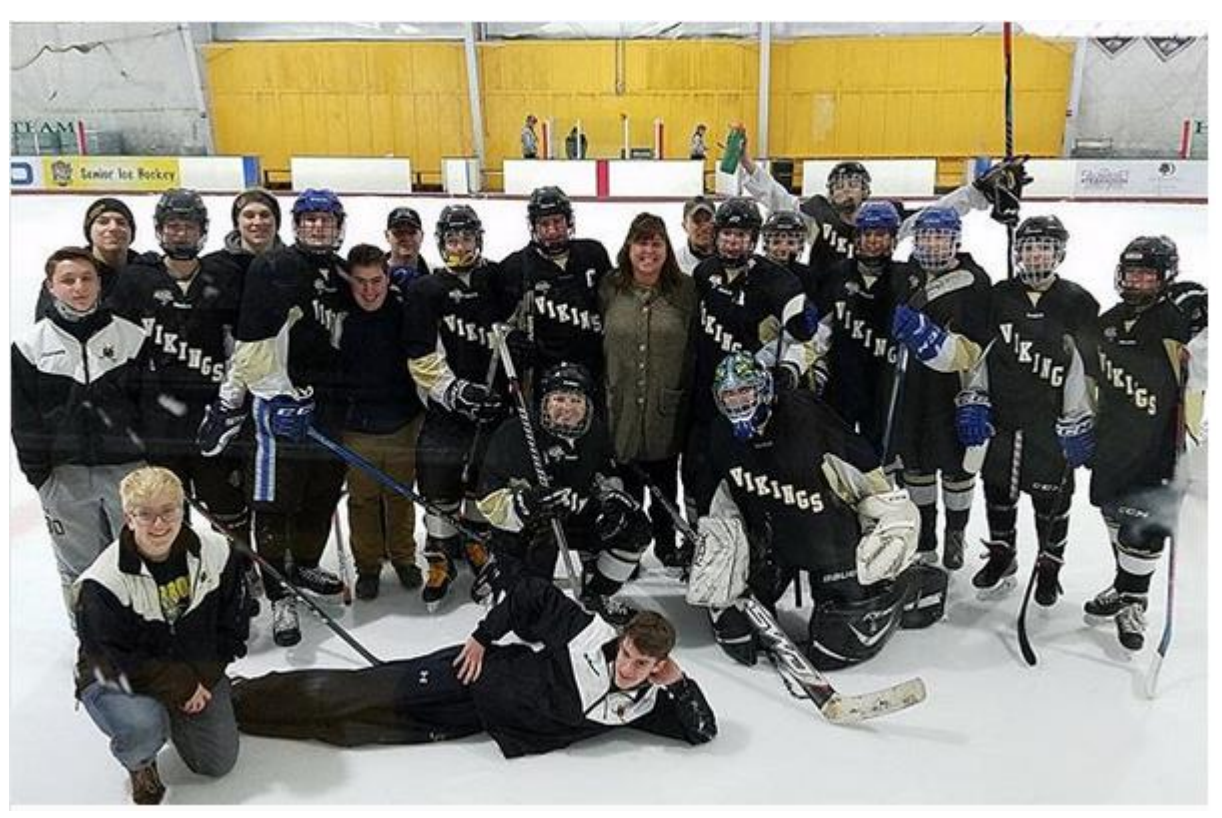
Congratulations to our Ice Vikes Hockey Team who defeated Atholton in a nail-biter of a game last weekend! So much fun to cheer on these dedicated athletes!